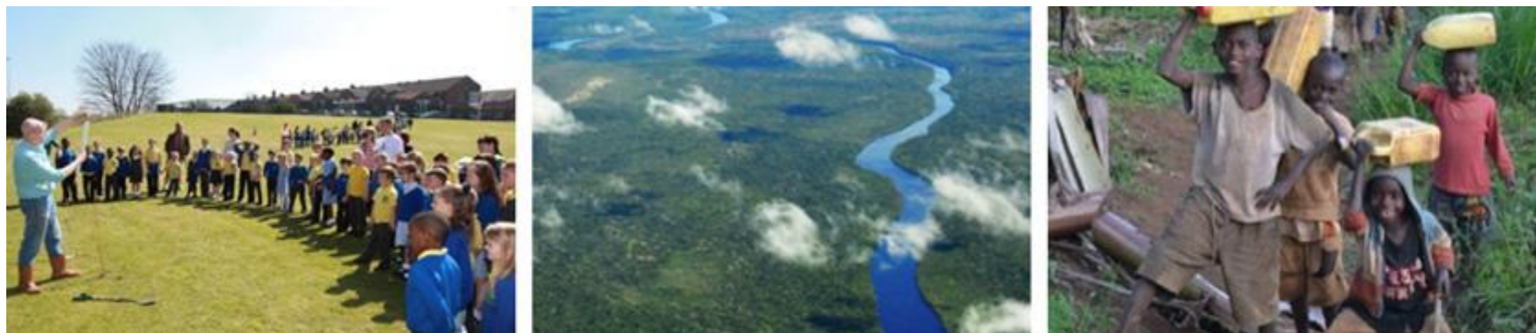
Sample Carbon Offsetting Projects - UK Schools Tree Planting - Amazon Avoided Deforestation, Brazil - Clean Water projects, Rwanda

The offsetting process is simple and straightforward - just visit www.carbonfootprint.com/carbonoffset.html and type in your CO 2 tonnage (from the front page of this report) and this will show you the latest range of projects and their pricings. Certification is available to download online.