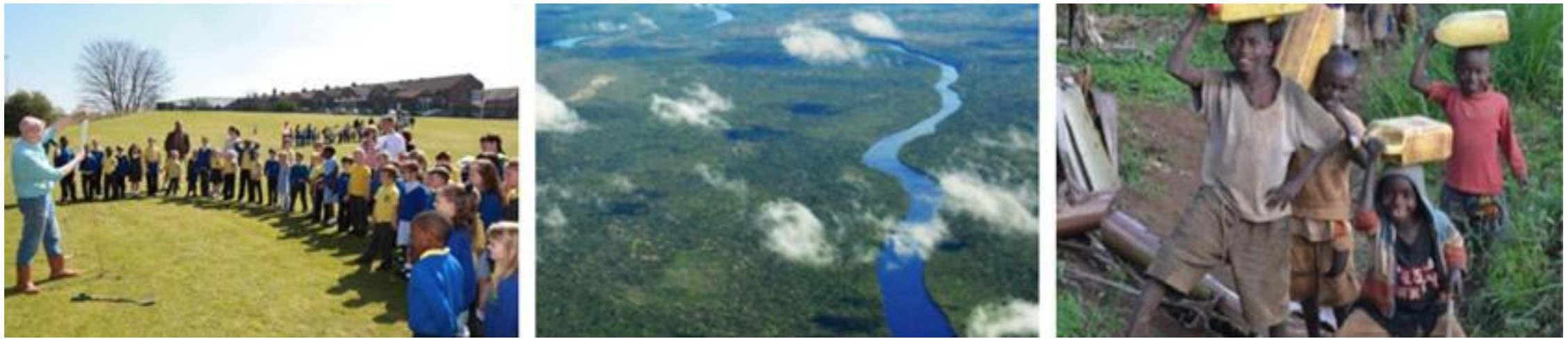
Sample Carbon Offsetting Projects - UK Schools Tree Planting - Amazon Avoided Deforestation, Brazil - Clean Water projects, Rwanda

The offsetting process is simple and straightforward - just visit www.carbonfootprint.com/carbonoffset.html and type in your CO 2 tonnage (from the front page of this report) and this will show you the latest range of projects and their pricings. Certification is available to download online.